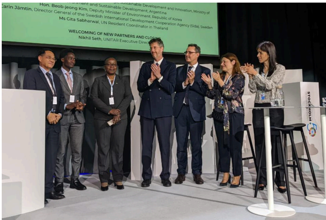
Cambodia and Rwanda were introduced as new partner countries at the PAGE side-event as part of the Stockholm 50+ Conference in June 2022.

Cambodia joined PAGE in 2022 under the leadership of the National Council for Sustainable Development chaired by the Minister of Environment and with participation of other government ministries including Ministry of Economy and Finance, Ministry of Mines and Energy, Ministry of Industry, Science, Technology, and Innovation, Ministry of Labor and Vocational Training, and Council for Development of Cambodia/Cambodia Investment Board. Private sector associations, research institutions and academia also supported Cambodia's application to join PAGE. The Department of Green Economy (DGE) is the coordinating Government institution and UNITAR is the coordinating UN agency.