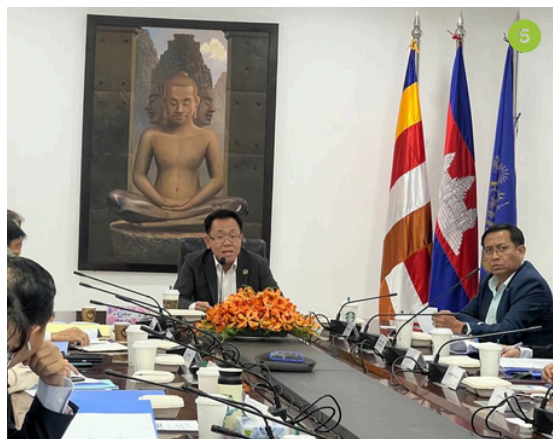
Photo credit: PAGE (1) and (4) Official launch of the programme implementation phase in 2023 (2) Inception mission in 2022 (3) Workshop on “Accelerating a Green and Fair Economic Transformation in Cambodia” in 2023 (5) First National Steering Committee meeting in 2024.