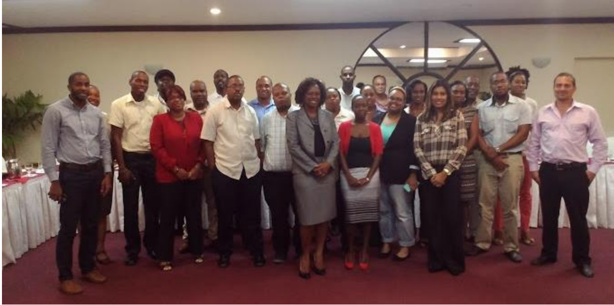
Image 1: Participants at the Green Economy Training Workshop held October 2014